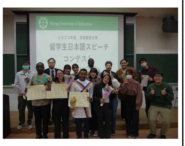
Japanese Speech Contest