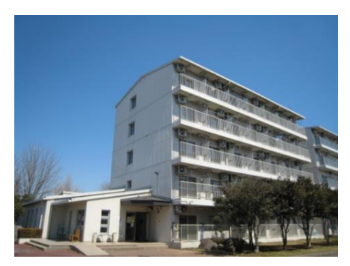
International House (dormitory)

To those who are interested, advice on further study at Japanese universities after completion of the MEXT program will be provided.