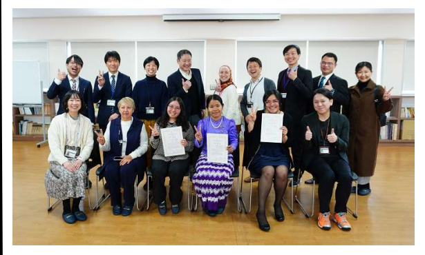
Completion Ceremony of Teacher Training Program