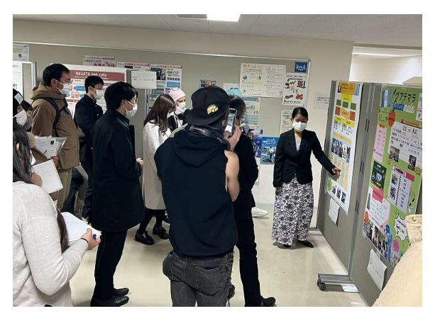
Poster Presentation at the Roundtable