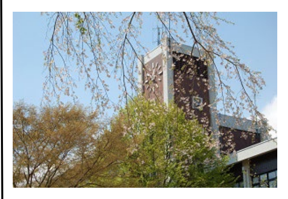
MUE spring and autumn