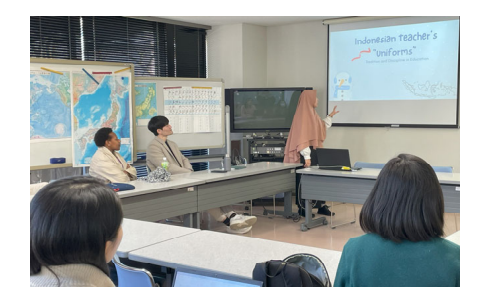
presentation at special seminar>