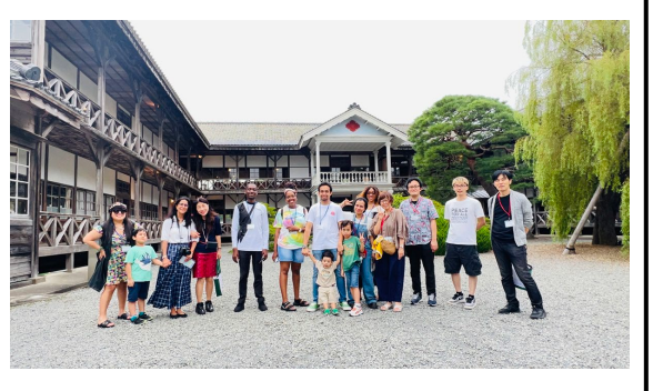
Intercultural Summer Field Trip to Toyoma

Even after finishing the course, many graduates have been personally taught by the supervising professors, Japanese Language teachers, and others through Internet.