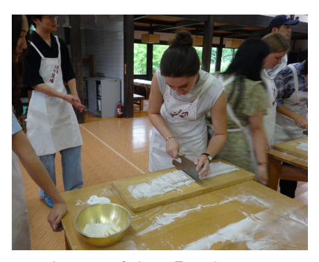
Japanese Culture Experience (Soba noodle cooking experience)